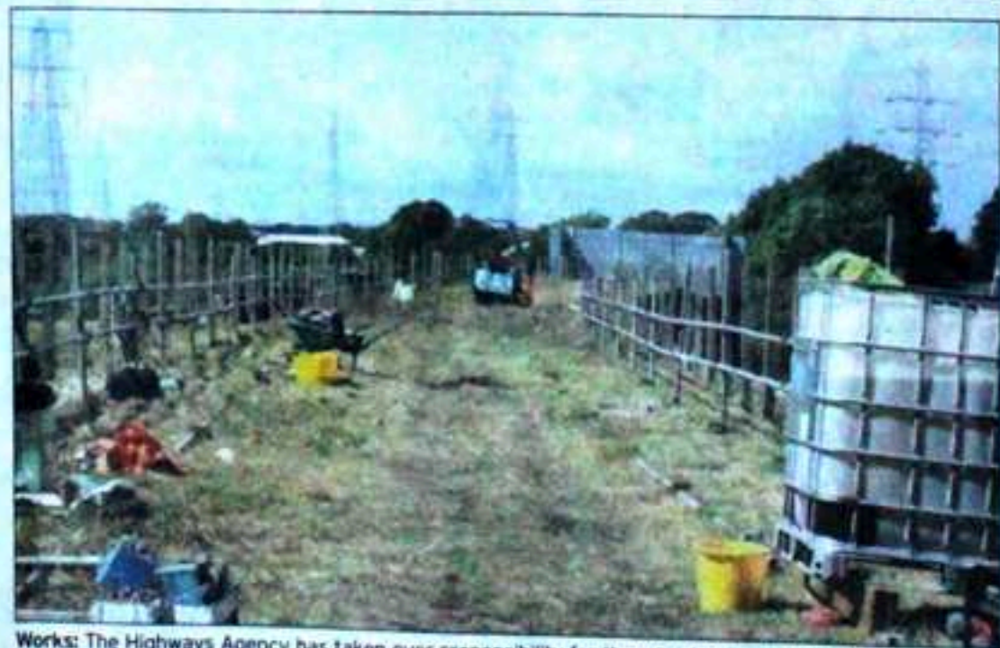
Works: The Highways Agency has taken over responsibility for the crossing from the British Rail Board Residuary (BRB)

ing people more chance to enjoy exercise.